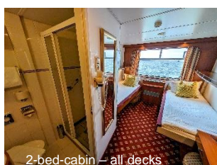
2-bed-cabin – all decks