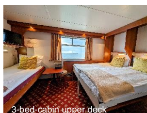
3-bed-cabin upper deck

Cabins: 57 all together, friendly and comfortably furnished with shower/WC, hairdryer, on-board telephone, TV/radio, safe and air conditioning. All cabins on both decks have a large panoramic window, of which the upper part can be opened.