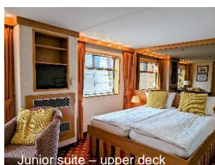
Junior suite – upper deck